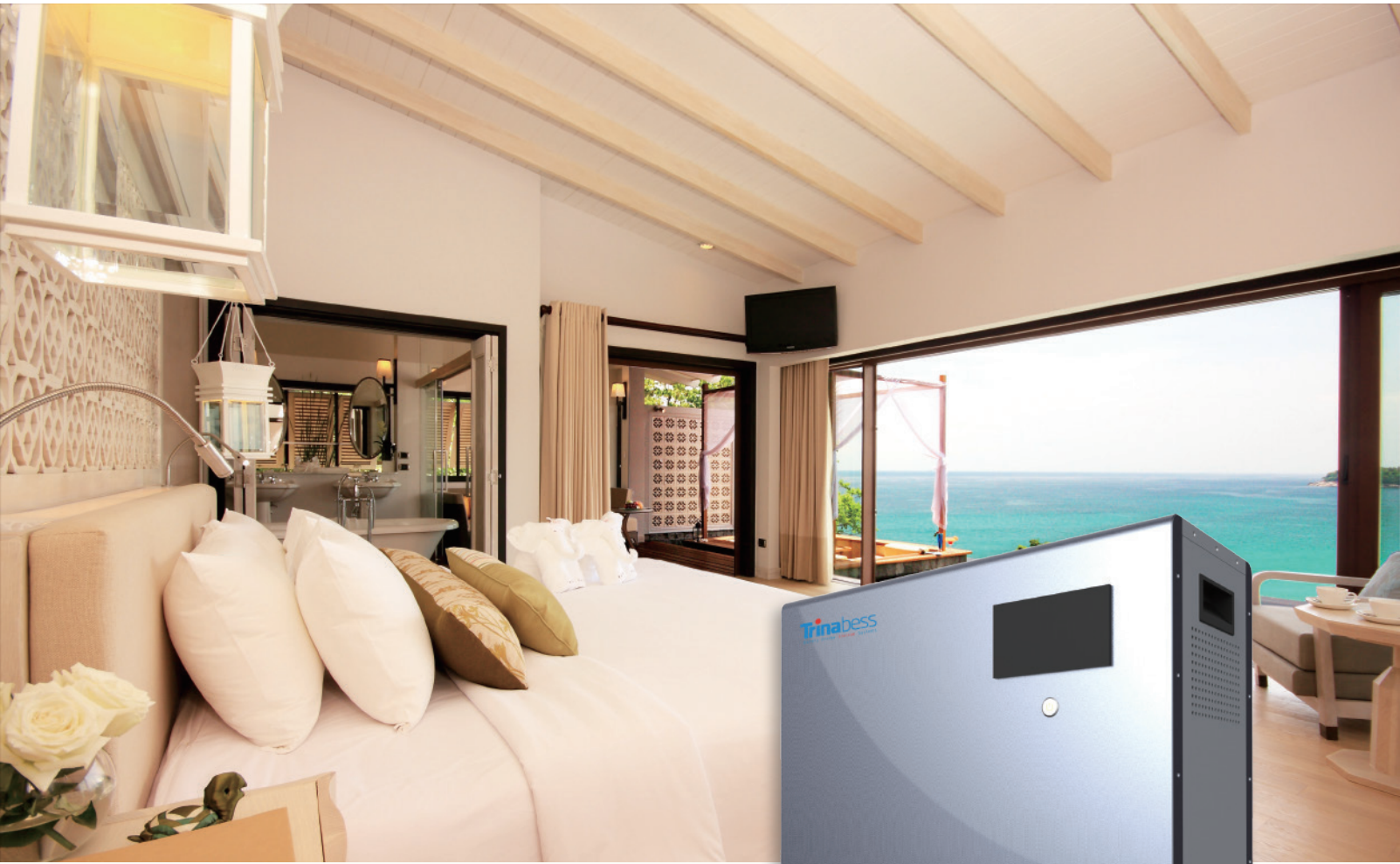
The all-in-one energy storage solution for off grid application